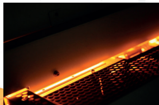
High-density inks with expanded gamut

SCREEN's next-generation, expanded gamut ink set "Truepress ink SC2" print directly to coated and uncoated stocks, drying quickly for less show through while maintaining high-density color saturation and improved print quality.