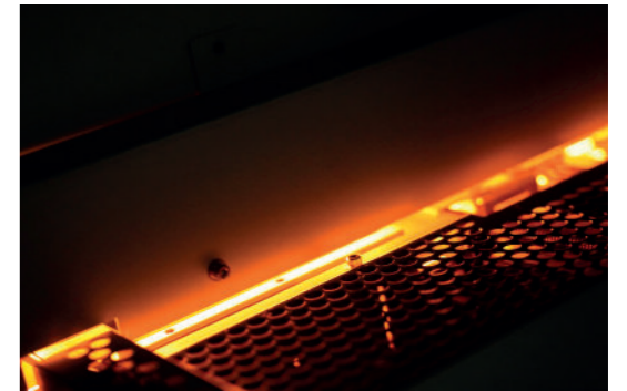
All new, high-efficiency drying system

The new drying technology boasts energy efficient design innovations, decreasing cost to operate and increasing profitability.