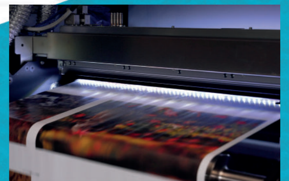
Automated monitoring print quality and managing color reproduction

The next-generation, fault tolerant inkjet heads are easy to replace with a simple fail-safe procedure enabling improved running time.