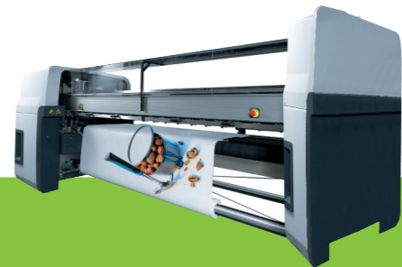
»WIDE FORMAT PRINTER«