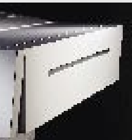
Optional interfaces compatible with most current platesetters permit unattended operation.

Modern printing technology demands high levels of precision and control at every stage - including the processor. The HD Polymer has therefore been designed with high-end compatibility - perfectly matching the high demands of quality and precision in the entire printing process. You can rest assured that the HD Polymer will provide pre-press quality to optimize the press performance.