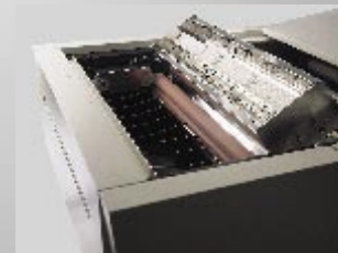
The specially developed pre-heat section ensures consistent and uniform heating of all plate formats.