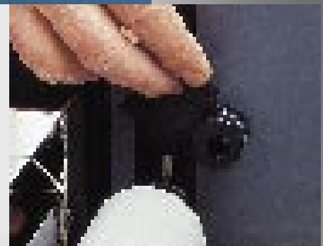
The snap-lock system makes roller removal fast and simple with no effect on factory pressure settings. The HD family's user-friendly design cuts service time by half.